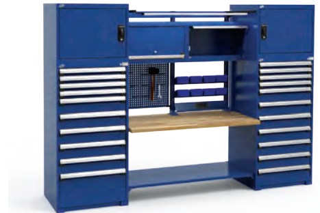
MAINTENANCE & REPAIR WORKSTATION