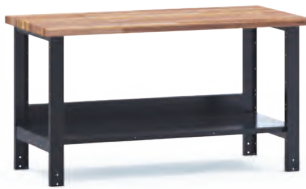
ALL-PURPOSE BASIC WORKBENCH

Go to rousseau.com for more suggested models.