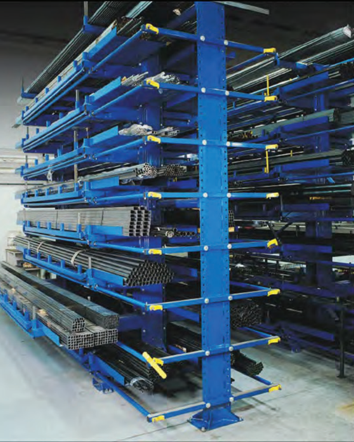
▲ Double-sided cantilever rack shown