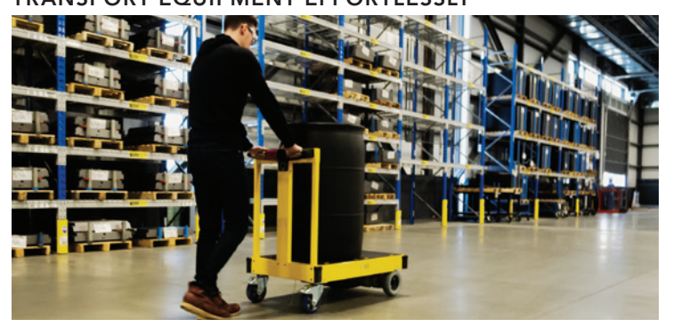
MOTORIZE YOUR TOOLBOX