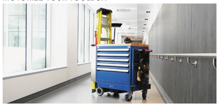
MOVE ITEMS EFFICIENTLY