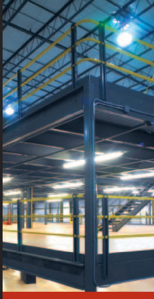
Cogan handrails and staircases meet your code:

Standard handrails are available in 2-rail or 3-rail designs with kick plate. Welded mesh or expanded metal handrails are available as an option to meet special code requirements or applications.