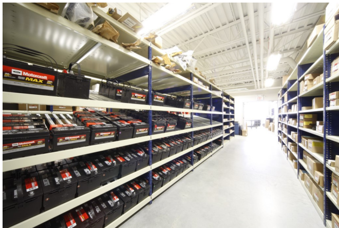
Top: An innovative use of mobile shelving for tire storage Bottom: Drawers in shelving provide high density parts storage Left: Rear loading battery storage moves older stock first