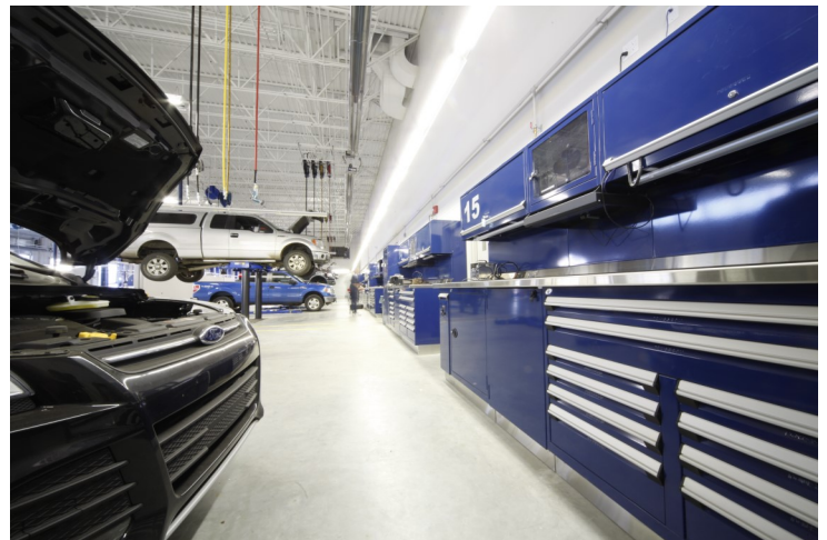
From left: Wide view of the Service Department, An organized tech workstation, beautiful and durable workbenches.